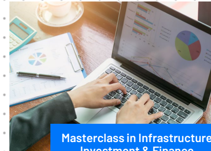
Masterclass in Infrastructure Investment & Finance