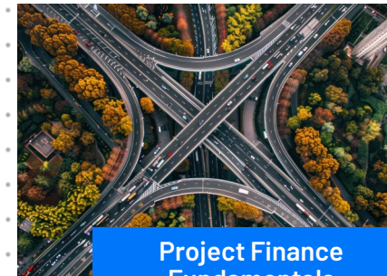
Project Finance Fundamentals