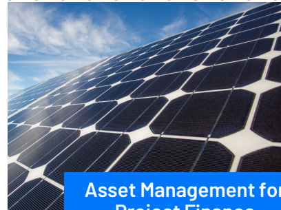
Asset Management for Project Finance