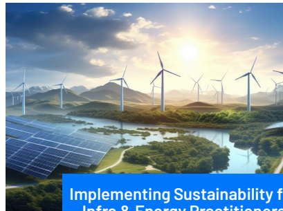
Implementing Sustainability for Infra & Energy Practitioners