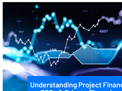
Understanding Project Finance, PPPs & Private Financing