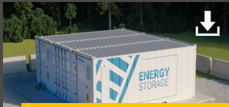
Salient Drivers of the Battery Storage Expansion across Europe