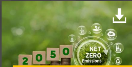
Maturity Assessment of Infrastructure for Net Zero