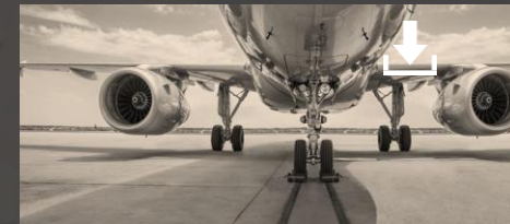
SAF – Opportunities and Risks for Investment