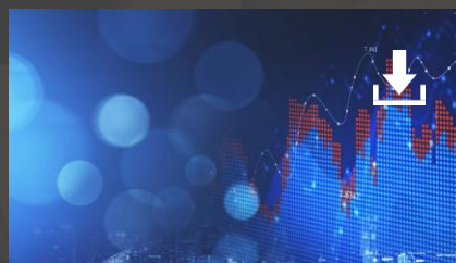
Facilitating the Bankability of Energy Transition Projects