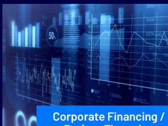
Corporate Financing / Project Financing