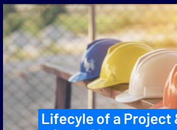
Lifecycle of a Project & Asset Management