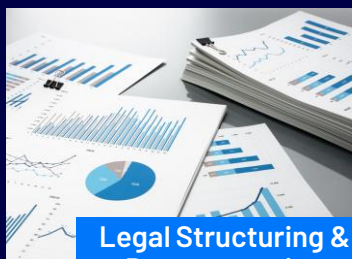
Legal Structuring & Documentation