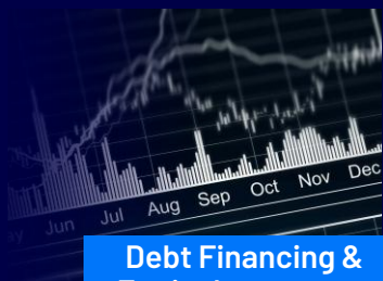
Debt Financing & Equity Investment