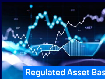
Regulated Asset Base Models