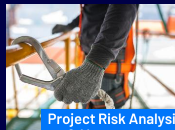
Project Risk Analysis & Management