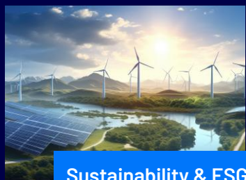
Sustainability & ESG