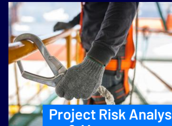
Project Risk Analysis & Management