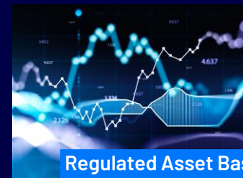
Regulated Asset Base Models