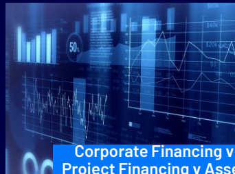
Corporate Financing v Project Financing v Asset Financing