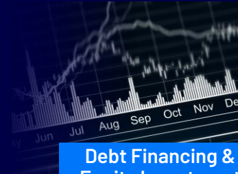
Debt Financing & Equity Investment