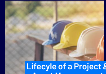
Lifecycle of a Project & Asset Management