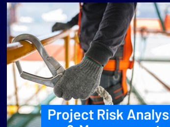
Project Risk Analysis & Management