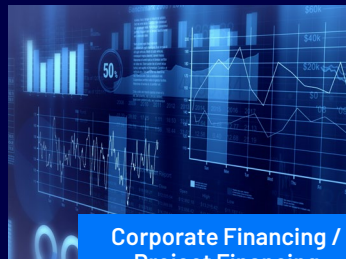
Corporate Financing / Project Financing