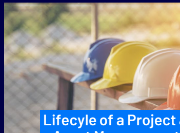
Lifecycle of a Project & Asset Management